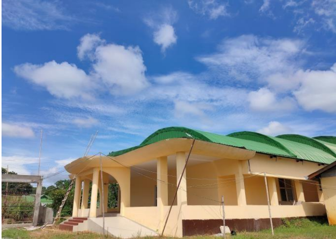
M C Chakrabarty Auditorium