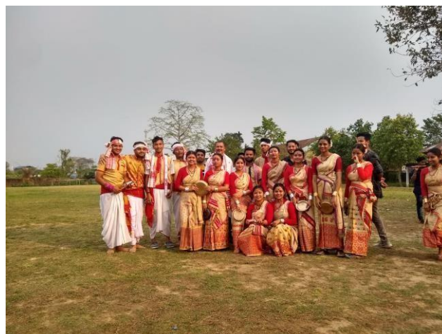
BIHU AT COLLEGE