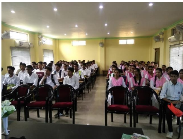
COLLEGE DIGITAL ROOM