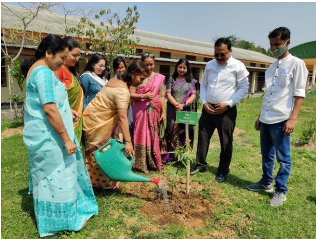
TREE PLANTATION AT COLLEGE