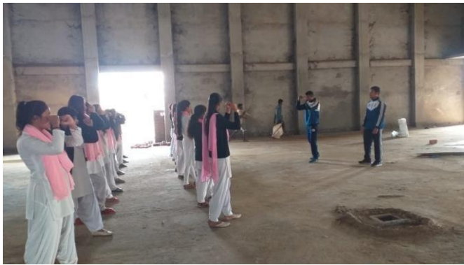
MUWATHAI TRAINING AT COLLEGE