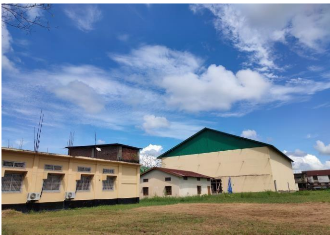
D N SARMAH INDOOR STADIUM