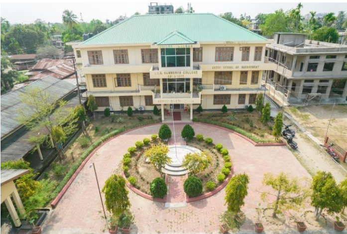
COLLEGE ADMINISTRATIVE BUILDING