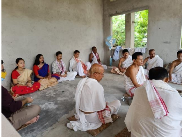
SANKARDEVA TITHI AT COLLEGE