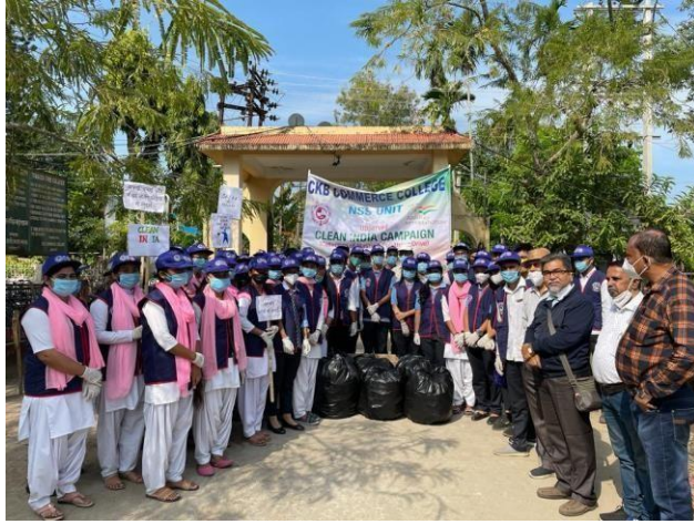
CLEAN INDIA CAMPAIGN