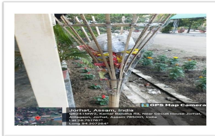
Dry waste collection bins