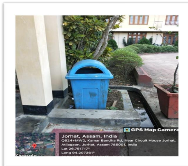
Dustbins placed all around the college campus